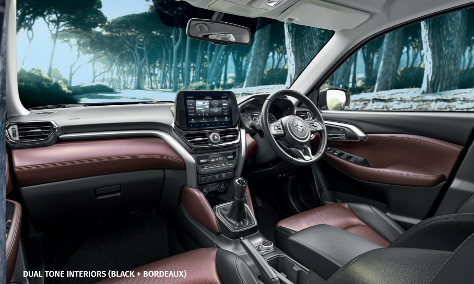
DUAL TONE INTERIORS (BLACK + BORDEAUX)