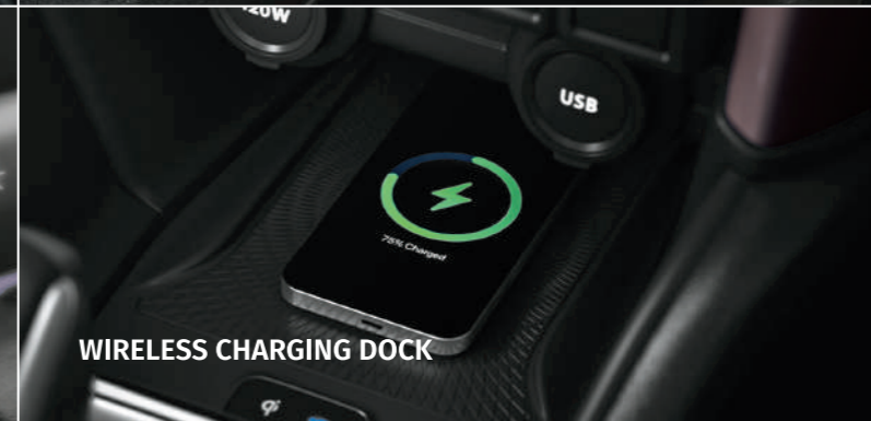
WIRELESS CHARGING DOCK