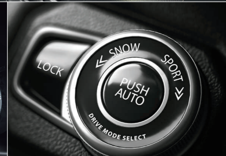
DRIVE MODE SELECTOR