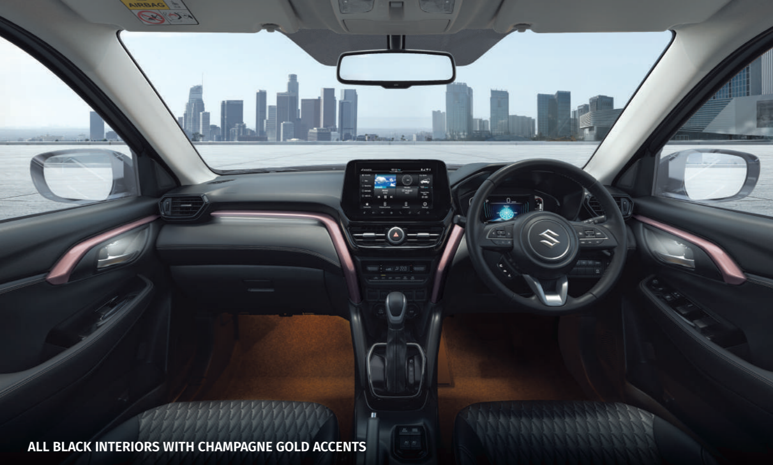
ALL BLACK INTERIORS WITH CHAMPAGNE GOLD ACCENTS