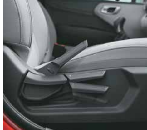
Driver seat height adjuster