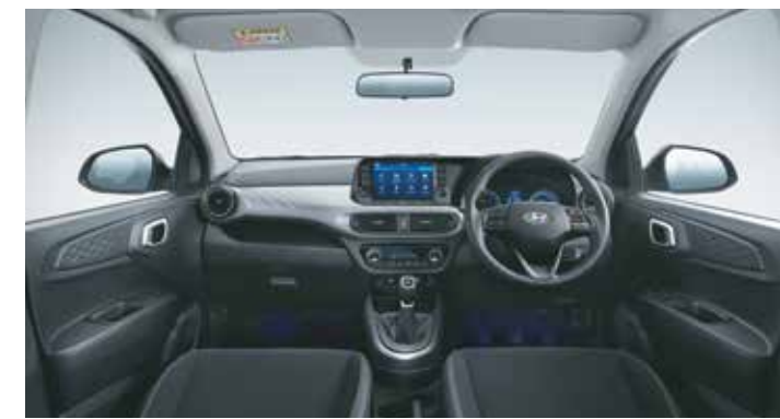
Dual tone grey interior Black interior with red inserts*