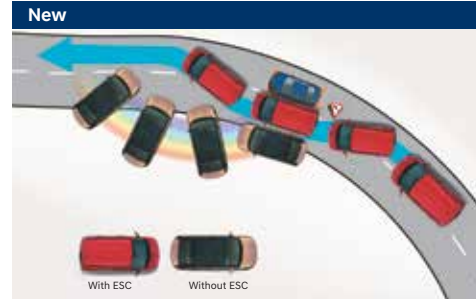
Automatic headlamps Electronic stability control (ESC) Vehicle stability management (VSM)