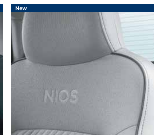
Semi fabric seat with piping