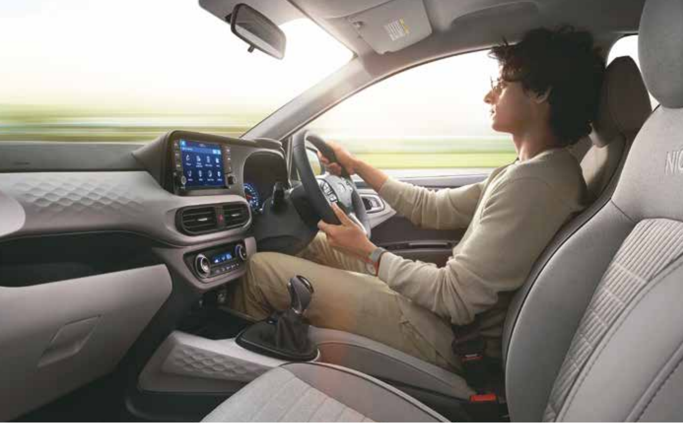
Dual tone grey interior