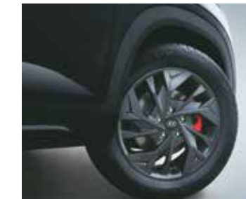
Red front brake callipers