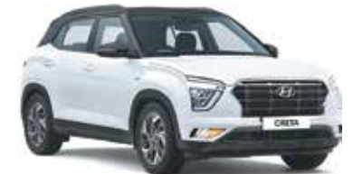
Polar white with phantom black roof