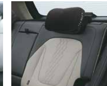
Rear seat headrest cushion