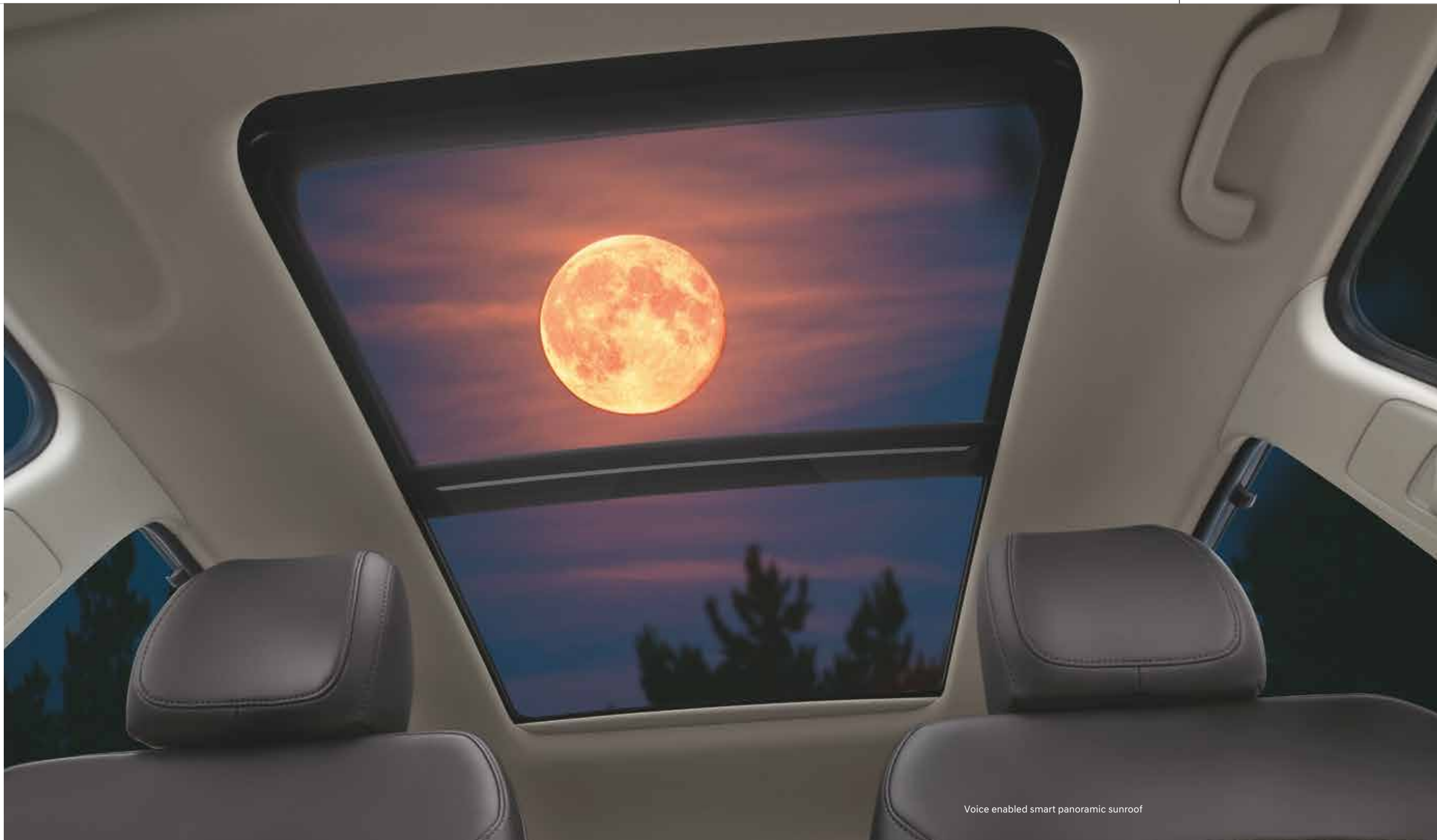
Voice enabled smart panoramic sunroof