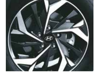
All wheel disc brakes