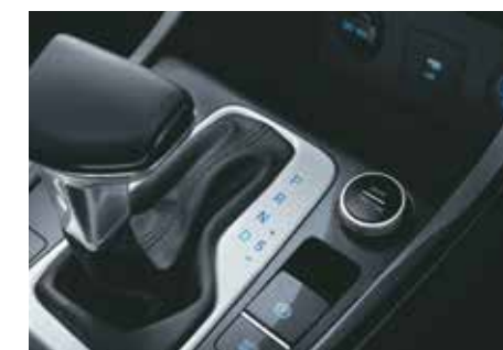
6-speed automatic transmission & IVT