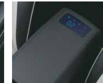
Auto healthy air purifier

Other features: Leather wrapped D-cut steering wheel | Leather TGS knob | Automatic headlamps | Smartphone wireless charger | Electro chromic mirror (ECM) | Door scuff plates – metallic | Rear window sunshade | Power driver seat - 8 way | Cruise control | 60:40 split rear seat | 2-step reclining rear seat