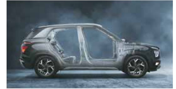
Strong body structure with AHSS