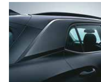
Black gloss C-pillar garnish