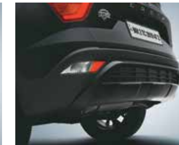
Black gloss front and rear skid plate