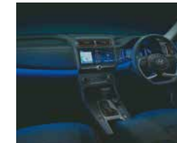
Soothing blue ambient lighting