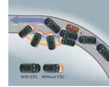
Electronic stability control (ESC)

The strong body structure with redefined standards of safety, ensure a secure drive for you and your family every time you hit the road.