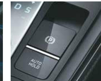
Electric parking brake with auto hold