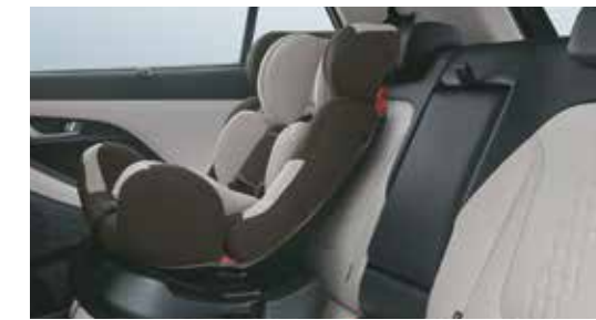
Child seat anchor (ISOFIX)