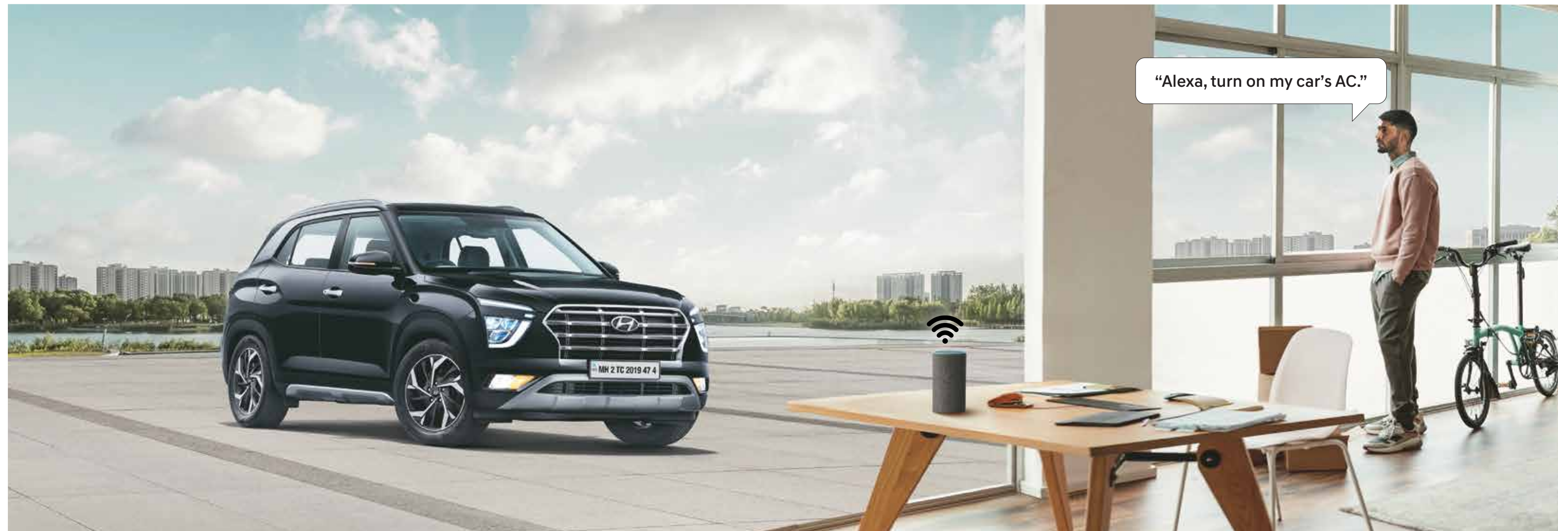
Home-to-car (H2C) with Alexa & Google Voice Assistant*