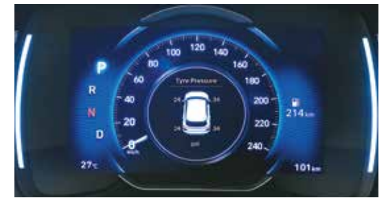
Tyre pressure monitoring system: Highline

Other standard safety features: Rear parking sensors | Speed alert system | Impact sensing auto door unlock Speed sensing auto door lock | ESS Other optional safety features: Rear camera with steering adaptive parking guidelines | Rear defogger with timer