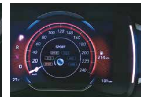
Drive mode select (eco, comfort & sport)