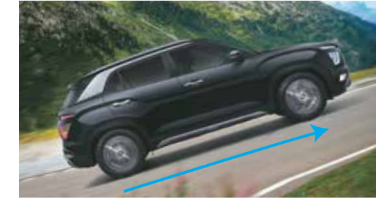
Hill start assist control (HAC)