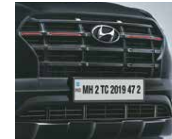
Black gloss radiator grille with red insert

With a breathtakingly beautiful and edgy design, Hyundai Creta has been crafted to command respect. The bold exterior and the new masculine stance will set you apart from every other SUV on the road. No matter where you decide to go, Hyundai Creta will help you stay one step ahead on the road.