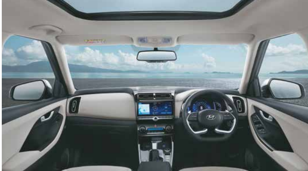
Two tone black & greige interiors - Available in standard CRETA