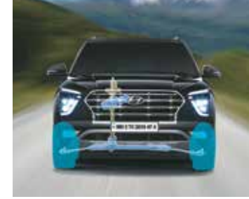
Vehicle stability management (VSM)