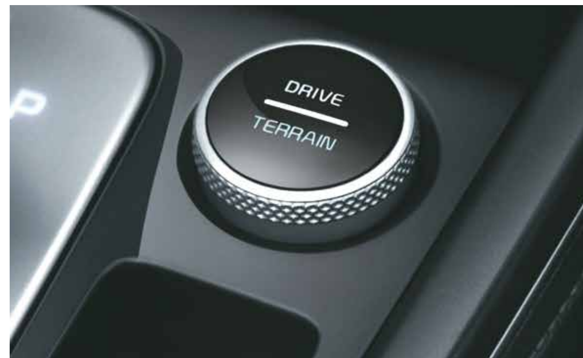
Traction control mode (snow, sand, mud)

With the 1.5l petrol and 1.5l diesel BS6 engines under the hood, Hyundai CRETA delivers a power packed performance on every terrain. Be it on the road or off it, Hyundai CRETA has the dynamism to go the distance.