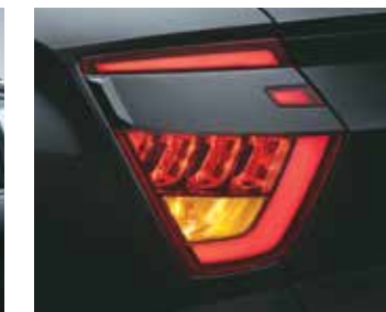
LED tail lamps

Other features: Body colour outside door handles | Phantom black shark fin antenna | Black gloss roof rails and outside rear view mirror