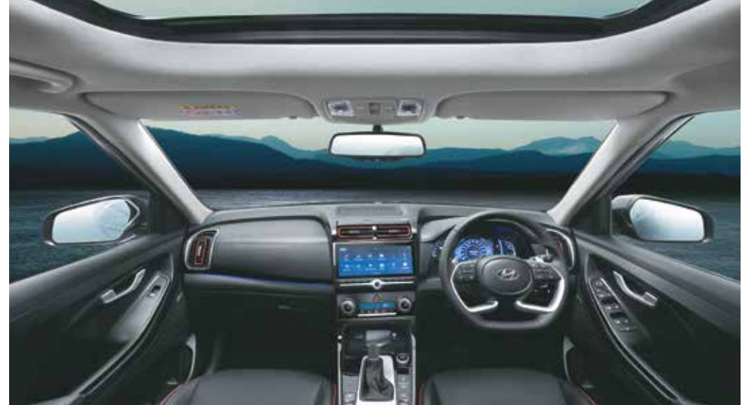
All-black interiors with coloured inserts - Available in Knight edition