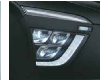
Trio beam LED headlamps with crescent glow LED DRLs