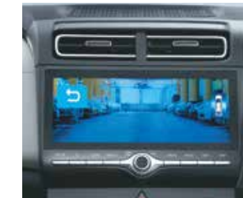
Driver rear view monitor

Savor the awe inspiring beauty all around when you get in Hyundai CRETA. The plush new interiors give you the advantage of extra comfort on every ride. Breathe in the wonders of nature and relish exquisite scenic views as you make your way across all-terrains of life.