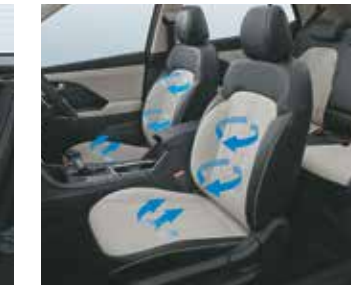
Front row ventilated seats