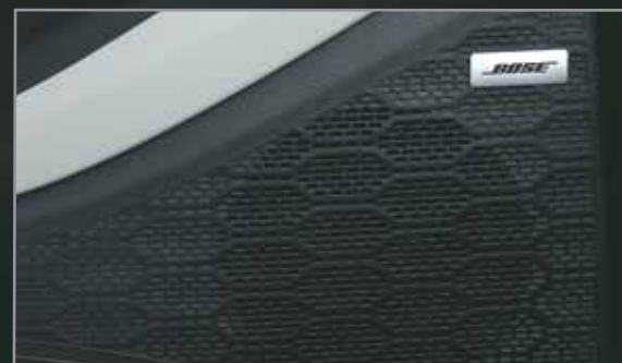
Bose premium sound system (8 speakers)