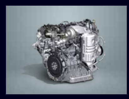
2.2 I Diesel Engine with 200 ps and 440 Nm Torque