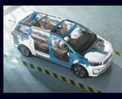
6 Airbags As Standard Our multi-directional safety package includes driver, passenger, side, and curtain airbags.

Its stance tells you in no uncertain terms that it's dynamic and ready to rumble. Hop into the cockpit, fire the 200 ps Engine, put the 8-speed Sportsmatic Transmission through the paces, and enjoy the aggressive performance. You'll agree that the Carnival is as exhilarating as it's extravagant.