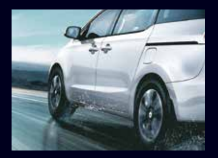
Electronic Stabilty Control As Standard It controls brake pressure in challenging BS-6 compliant 2.2 I Diesel Engine is packed with power and performance. driving situations like sudden turns, acceleration, and braking.