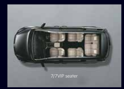
Seat Configuration Comes with two 7 seater options, for all kind of needs.