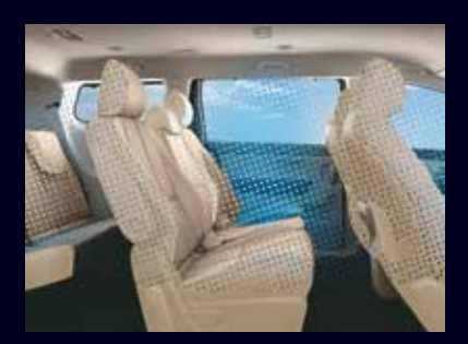
Tri Zone Automatic Temperature Control 6-speaker Sound System Every row is assured of absolute comfort, thanks Let the premium 6-speaker sound system to independent controls for temperature and immerse you in an extravagant surround airflow.