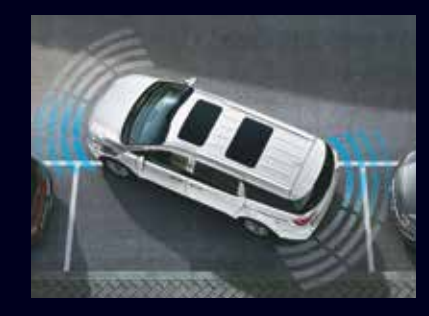
Front and Rear Parking Sensors As Standard These sensors help you to safely manoeuvre and park in peculiar Indian conditions.