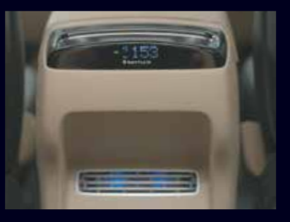
Smart Pure Air Purifier with Virus Protection**

VIP seats with Premium Leatherette The soft, full-grain, premium quality leatherette along with leg support of VIP seats, offer ultimate cabin air unaffected by the pollution outside. comfor