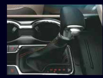
8-Speed Sportsmatic Transmission (8AT) Enjoy superior driving pleasure and dynamic performance with this transmission, which is one of its kind.