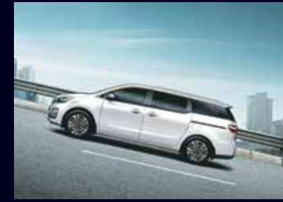
Hill Start Assist Control As Standard Hill Start Assist Control prevents the vehicle from rolling back during uphill climb from a static position.