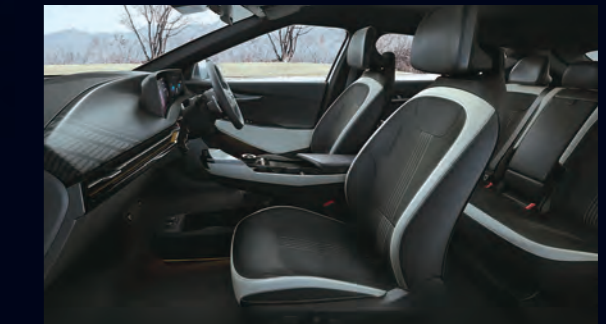
Black Interior - Black Suede Seats with Vegan Leather Bolsters