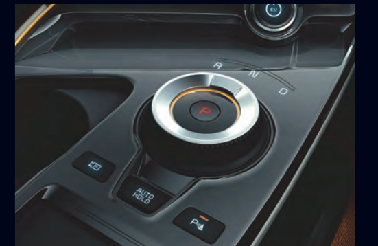
Shift By Wire Change gear position simply by turning the dial of Shift by Wire system left or right