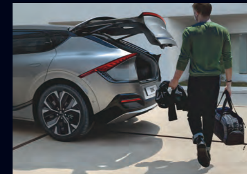
Smart Power Tailgate The power tailgate can be set to open automatically to a desired height