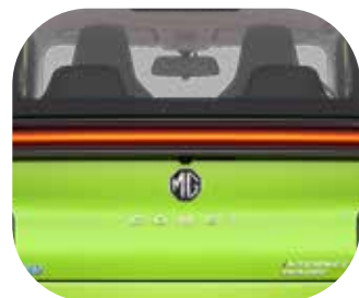
► EXTENDED HORIZON FRONT & REAR CONNECTING LIGHTS