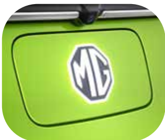
► ILLUMINATED MG LOGO

The futuristic motif of this car brings you a smart, sleek look with the 2-door design. Because we believe that your car should only bring you things that spark joy. Quite like the logo that illuminates every time you open the door of the car.