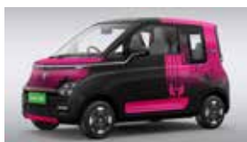
► NIGHT CAFE