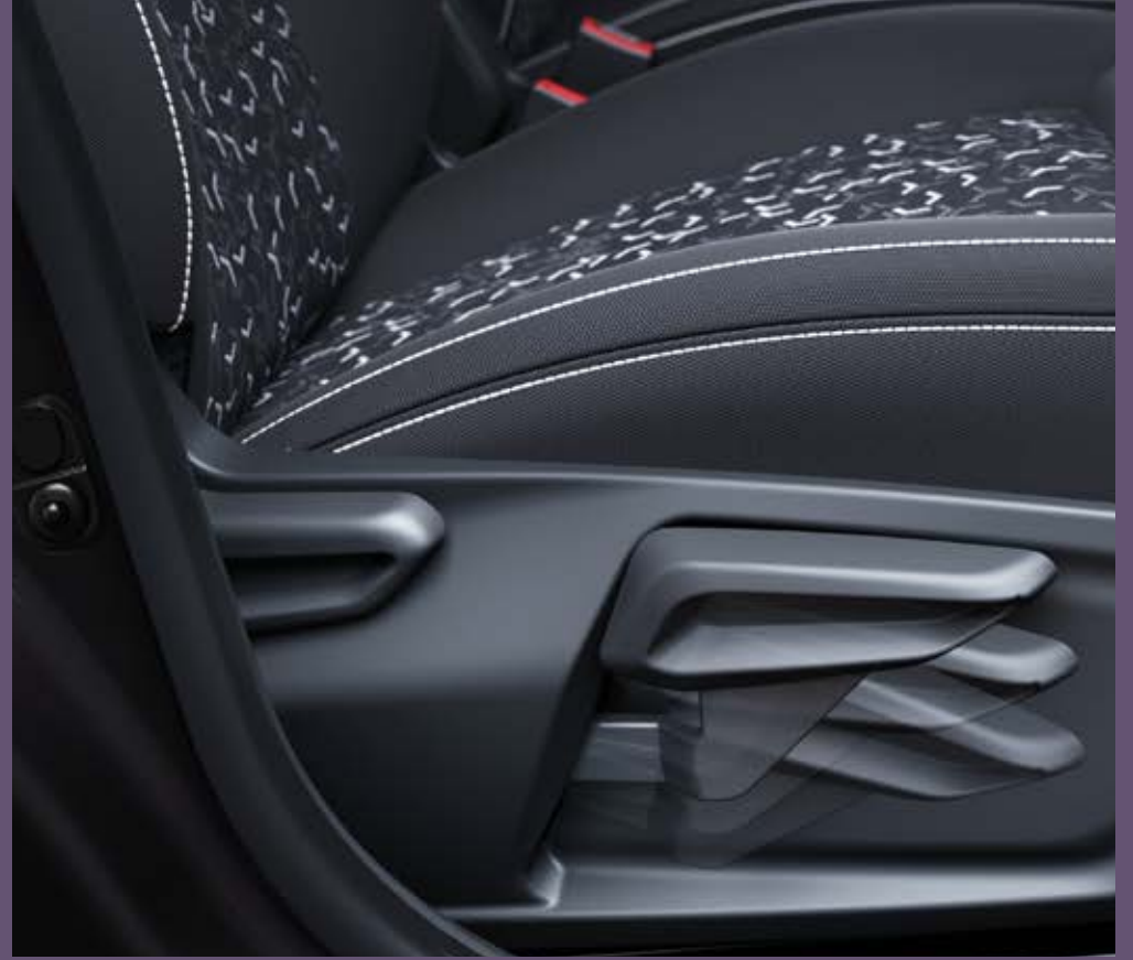
Height Adjustable Driver Seat 242 l Boot Space