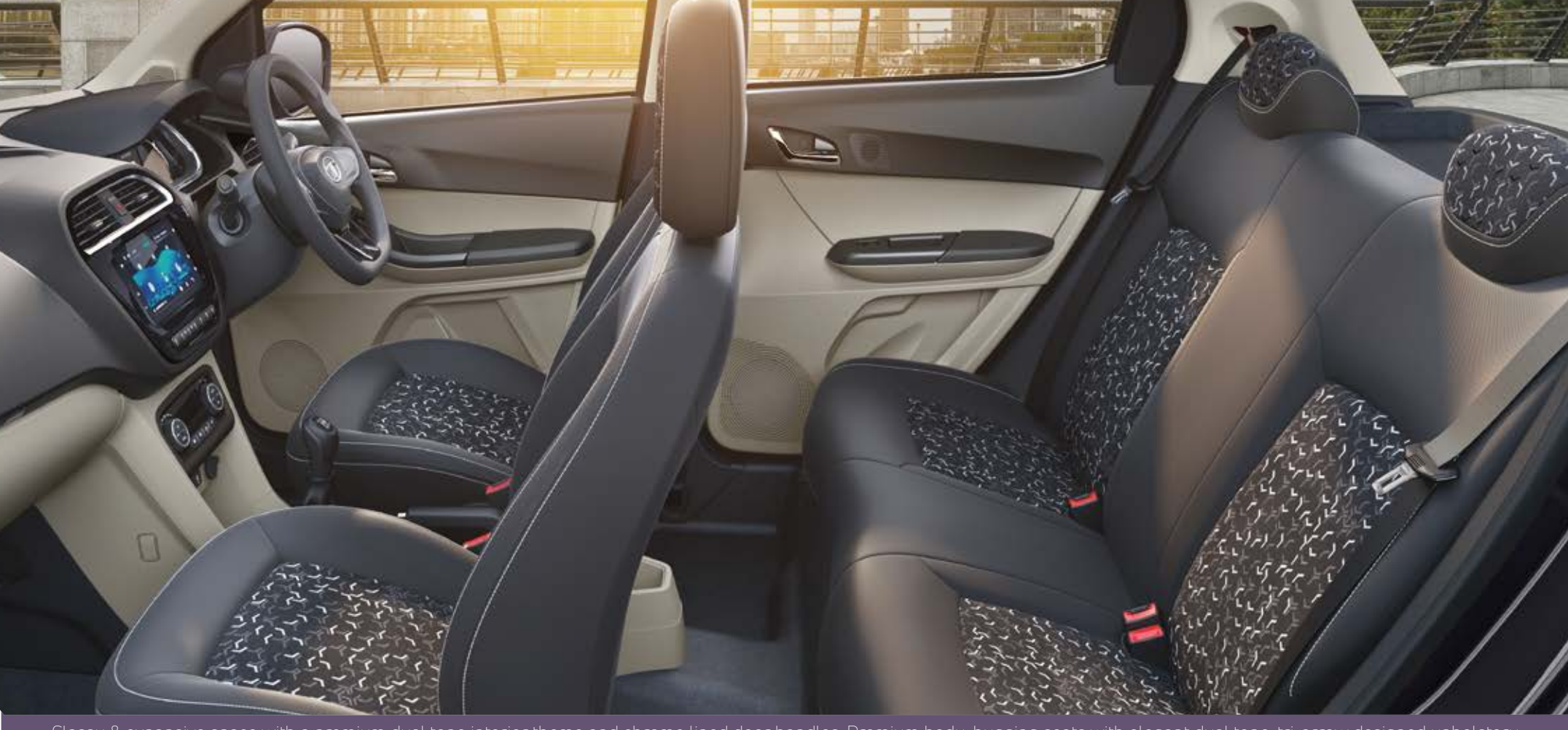
Classy & expansive space with a premium dual tone interior theme and chrome lined door handles. Premium body-hugging seats with elegant dual tone, tri-arrow designed upholstery